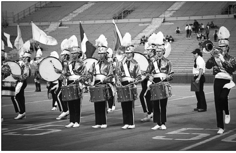
1974: Toronto Optimists drums (CNE)

It looked as if the Corps of 1975 would be the biggest ever fielded. After what was considered a disastrous year, the membership certainly had not suffered.