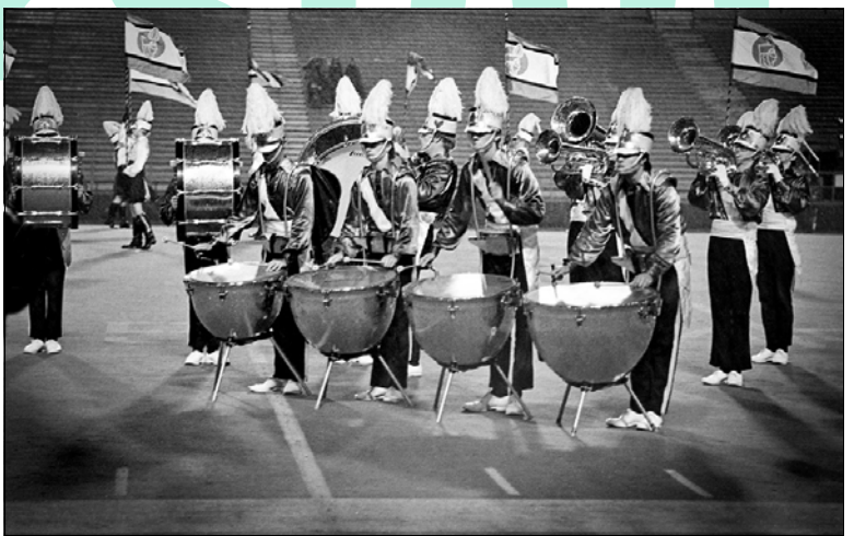
1974: Toronto Optimists Tymps (CNE)

Still at the Symposium, another award made its debut that night. This award was picked by,