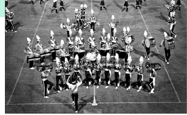
1974: Toronto Optimists

De La Salle would not be in it this year, due to failure to comply with C.D.C.A. dictates regarding the use of overage people and releases. This did not mean they were using them, just not toeing the C.D.C.A. line in this respect. This left the door open for a number of Corps to claim the title, the Optimists being one of them.