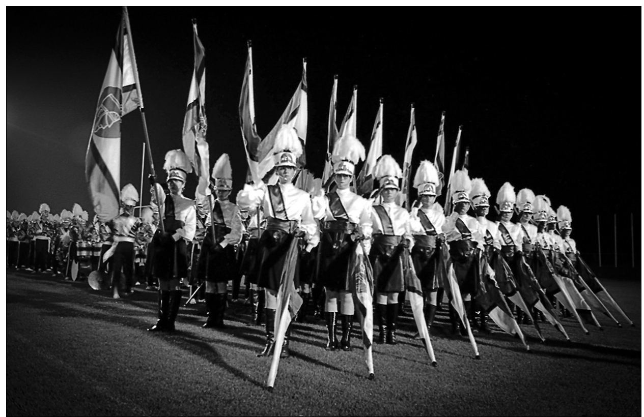
1974: Toronto Optimists Colours on retreat

All Awards were given out and the usual customs observed. With this affair, the year was over. The arrangements were in place for the coming year. It just remained to see what it would bring.