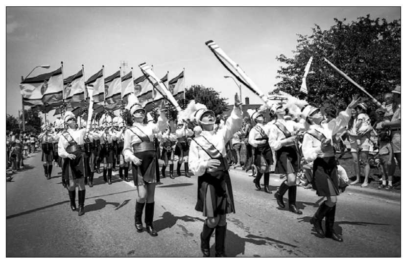
1974: Toronto Optimists rifles in a parade

Things did improve, for a while. Everything clicked at Seneca College when the Optimists placed only seven from De La Salle, but four and eight ahead of Seneca Princemen and Etobicoke Crusaders, respectively. After this blip, surprisingly, the Corps was given a two-week vacation. Rehearsals were optional. They were held, and