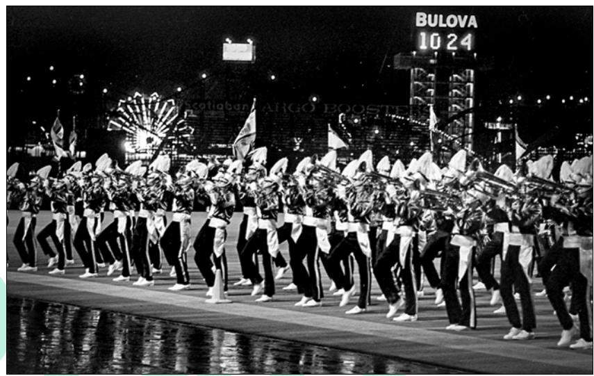
1974: Toronto Optimists (CNE)

The Optimists were ready to field 100 members with more than 40 bugles, 30 on percussion and a guard of 30. Such numbers were now necessary. When considering that in 1958 an entire Corps numbered between 40 and 50, one can see the changes that had occurred.