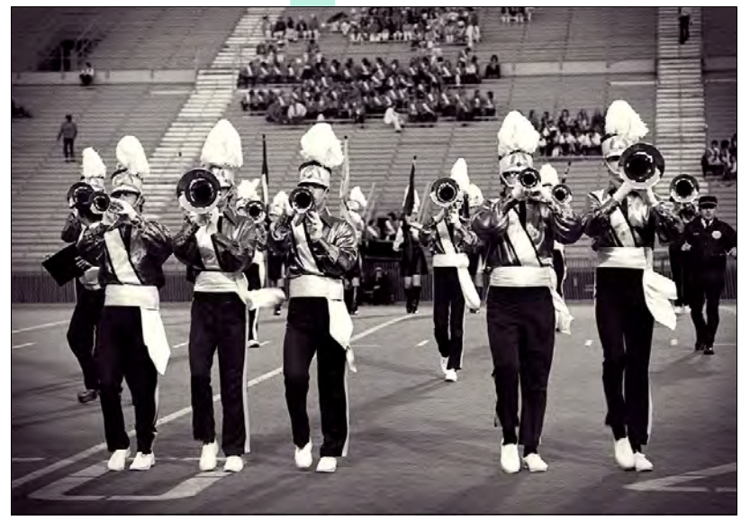
1974: Toronto Optimists horns (CNE)

And the Optimists? Despite putting on their best show of the